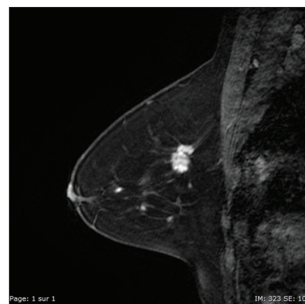
Figure 1. Sagittal VIBRANT® image of an invasive breast carcinoma.

Two radiologists (a junior physician with 6 months of breast MRI experience, and a senior physician with 5 years of experience) individually reviewed the images in two stages separated by at least two weeks with randomization so as to limit all bias. Abbreviated and complete protocols were mixed in the two stages. For both stages, the readers had access to the previous examinations and clinical information, but not to the later examinations, current breast MRI report, and later possible anatomopathology analysis or imaging follow-up. For every reader, the order of the two stages was randomized and the reading of the abbreviated protocol was blinded from the reading of the complete protocol. For each breast, the readers indicated the size, the quadrant, the type of lesion in case of anomaly, and the ACR BI-RADS classification. The duration of read outs were also noted. The BI-RADS classifications were then compiled according to the implication